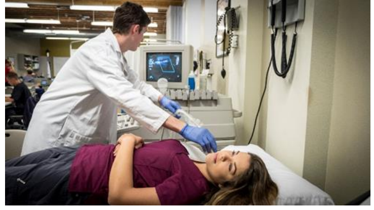
APPLY NOW! Download the application at: <a href="https://www.peoriaunified.org/met">www.peoriaunified.org/met</a>